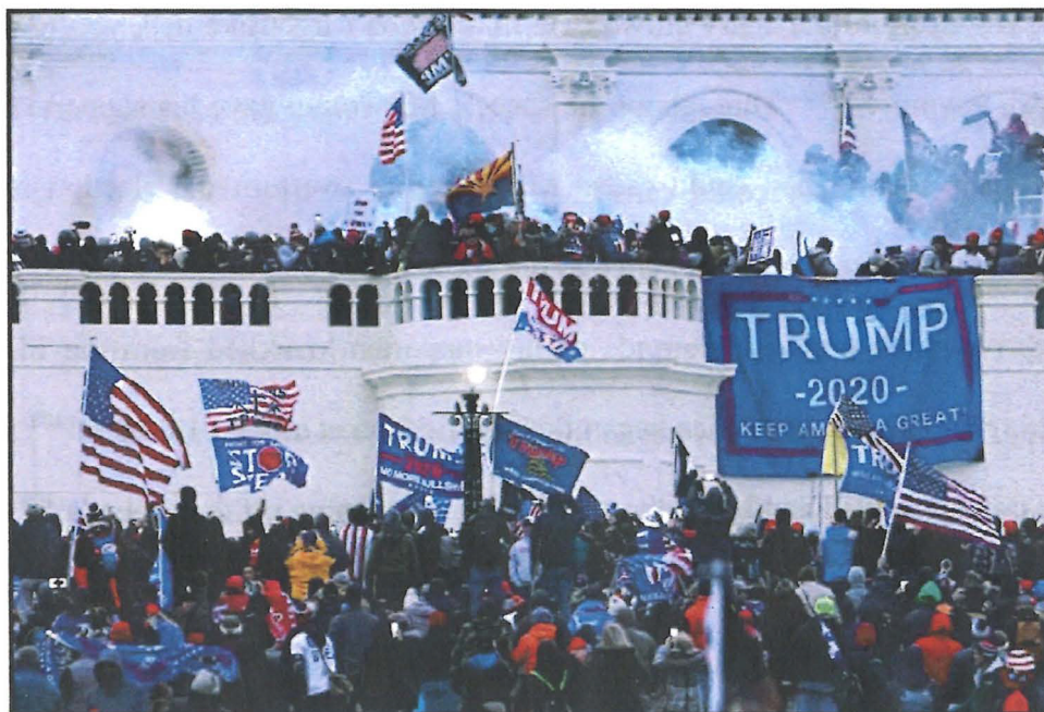
Photograph of the Capitol on January 6, 2021 112