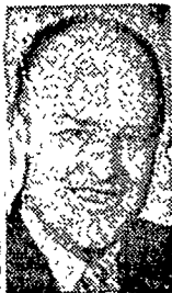
Melvin R. Laird

"nonpolitical," is scheduled for 10:05 a.m. in Uihlein Hall.