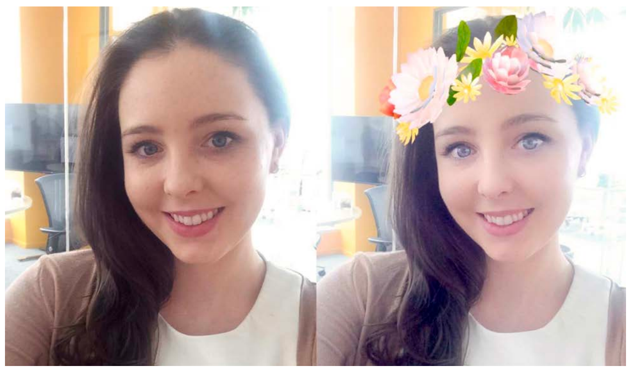
An example of Snapchat Beautification filters.

Is it surprising that mental health problems surge when millions of kids negotiating their identity in public with immediate feedback are taught, "people like you... if only you looked different than you actually are."