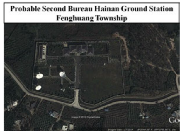
Figure 6: Google Earth Satellite Image of Probable Second Bureau Hainan Ground Station