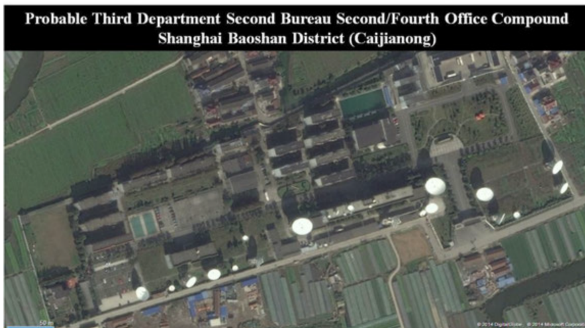
Figure 3: Probable Third Department Second Bureau Second/Fourth Office