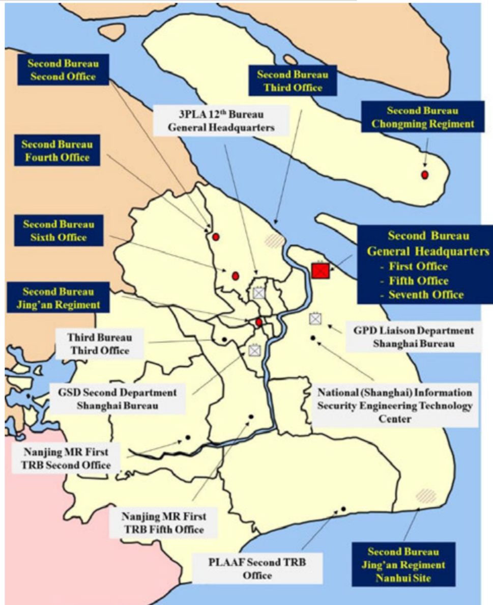
Figure 7: Shanghai's Military Intelligence Community