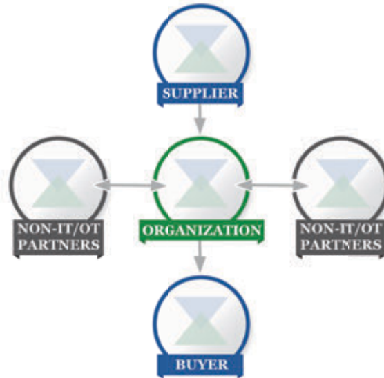
Figure 3: Cyber Supply Chain Relationship

As depicted in Figure 3, cyber SCRM encompasses IT and OT suppliers and buyers as well as non-IT and OT partners. These relationships highlight the critical role of cyber SCRM in addressing cybersecurity risk in the critical infrastructure and the broader digital economy. They should be identified and factored into the protective and detective capabilities of organizations, as well as the response and recovery protocols of organizations.