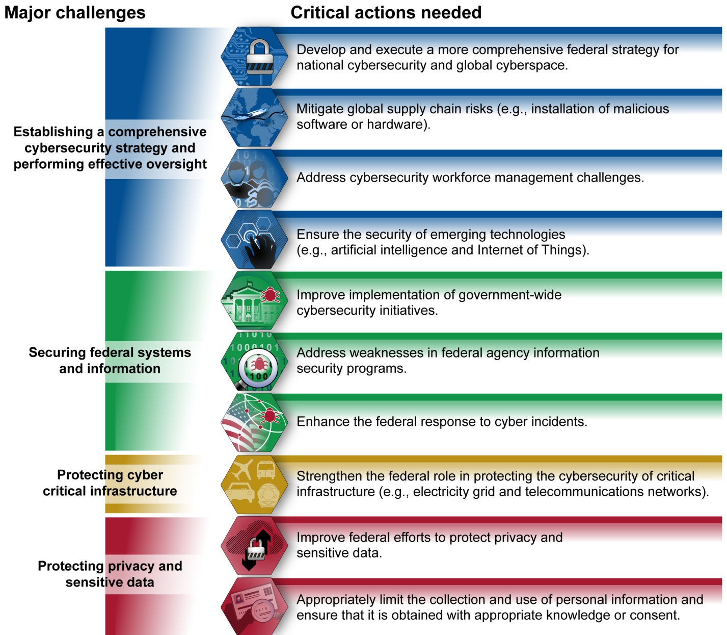
Figure 4: Ten Critical Actions Needed to Address Four Major Cybersecurity Challenges