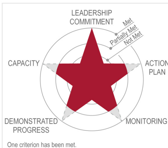
Figure 3: Status of High-Risk Area for Ensuring the Security of Federal Information Systems and Cyber Critical Infrastructure and Protecting the Privacy of Personally Identifiable Information, as of February 2017

As we reported in the February 2017 high-risk report, 21 the federal government's efforts to address information security deficiencies had fully met one of the five criteria for removal from the High-Risk List—leadership commitment—and partially met the other four, as shown in figure 3. We plan to update our assessment of this high-risk area against the five criteria in February 2019.