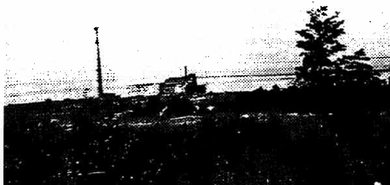
First Western Picture of Obninsk Plant

In 1954 the Russians publicized the initial operation of the first atomic power station in the world at Obninsk (the variant name used for the town served by Obnino station).