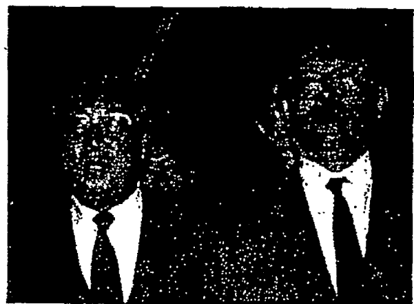
(S) North Korean President Kim Il-song (l) and Chinese President Jiang Zemin. Chinese and North Korean interests probably will diverge during any crisis over the North Korean nuclear issue, despite their formal solidarity.