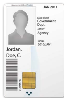
Figure 1: Example of PIV Card

OMB M-05-24, Implementation of Homeland Security Presidential Directive (HSPD) 12 – Policy for a Common Identification Standard for Federal Employees and Contractors (August 2005), required Federal agencies to implement the HSPD-12 PIV card as the standard for a secure and reliable form of controlling logical and physical access to Federal facilities and information systems, including local and network systems operated by Federal and contractor employees. Lagging progress by agencies related to implementing PIV cards resulted in the issuance of OMB M-11-11, Continued Implementation of Homeland Security Presidential Directive (HSPD) 12 – Policy for a Common Identification Standard for Federal Employees and Contractors , in February 2011. The updated guidance required that each agency develop and issue an implementation policy by April 2011 that required the use of the PIV credentials as the