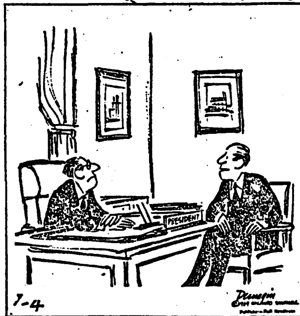
"THOSE STUDENTS YOU HIRED FOR THE SUMMER HAVE TAKEN OVER THE PERSONNEL OFFICE, AND HAVE DECIDED TO LET YOU GO."