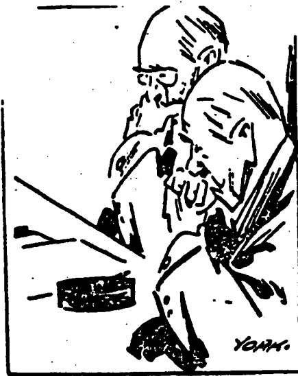
"What worries me as a politician is that the silent center is beginning to pop off."