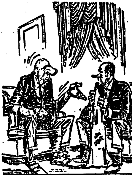
"You could ask for a popular vote on the issue and threaten to resign if it failed."