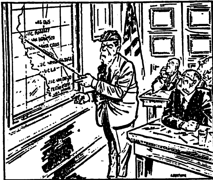
"Imagine if you will, gentlemen, a row of dominos."