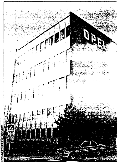
The Opel plant in Rüsselsheim

To wire other cars, Army intelligence devised an ingenious scheme. Agents discovered that the Soviets had ordered a fleet of customized diplomatic cars from the Opel plant in Rüsselsheim, 15 miles from Frankfurt. The agents developed a plan to gain access to the plant at night, take apart the car, install a sophisticated transmitter into its frame and re-