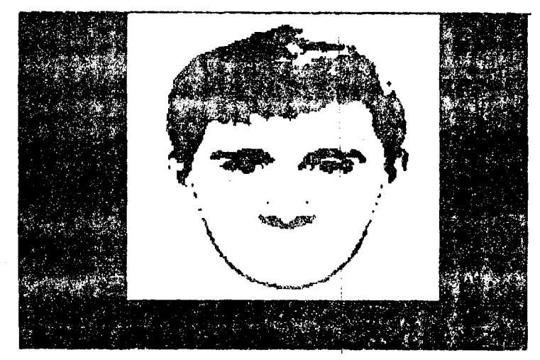
Figure 3. Face with three elements selected

Approved For Release 2000/08/15 : CIA-RDP96-00792R000701060001-3