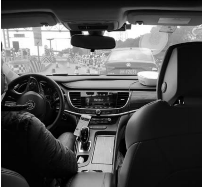
Figure: Health inspection site on highway between Shanghai and Kunshan.

39. (SBU) Health inspection sites on highways between Shanghai and other cities remain in place. A Consulate EFM January 29 observed four health inspection sites on the highway between Shanghai and Kunshan. Despite light traffic on the highway, long queues were present at inspection sites, where temperatures of all drivers and passengers were being checked.