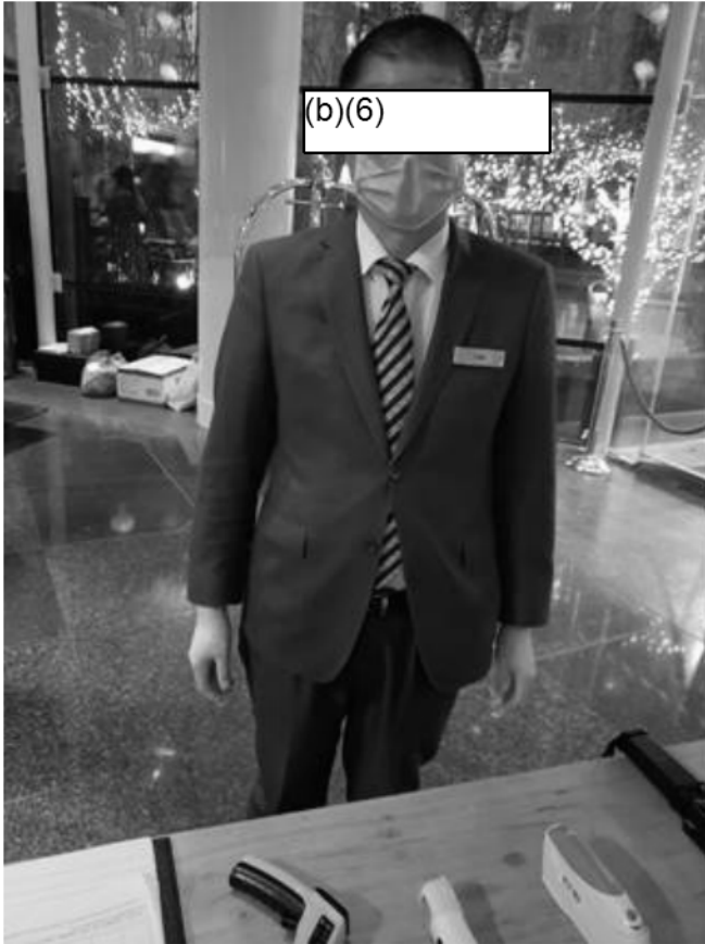
Figure: Hilton Beijing staff conducting temperature checks of hotel guests