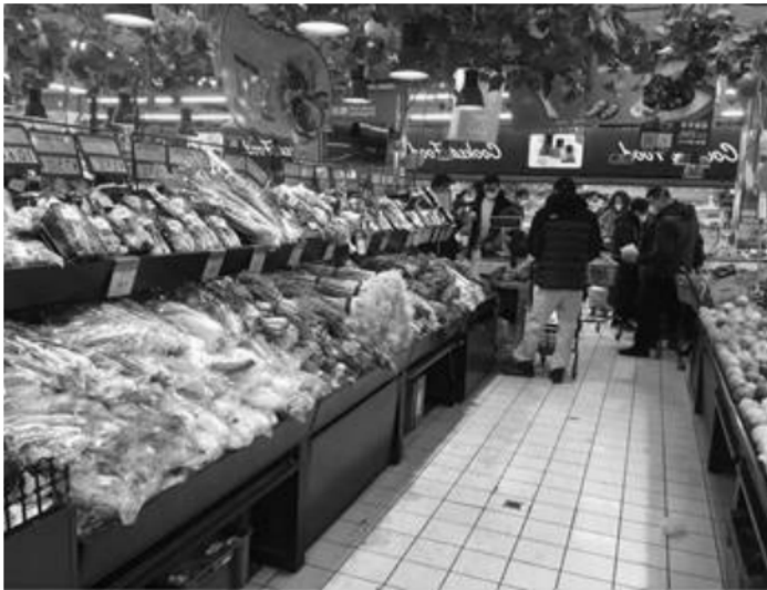
(SBU) Figure 1: Shoppers in Beijing grocery store

14. (SBU) ESTHOFF visited three grocery stores in Beijing on January 31. All were fully stocked with fresh produce, meat, and dry goods (including instant noodles). Crowds were minimal, and no abnormal purchasing behavior or hoarding among shoppers was observed. Prices had not visibly increased. Incoming shoppers did not have to undergo temperature checks or screenings. Two of the stores had limited mask purchases to one per customer and still had some masks in stock (the third is an import grocer that does not normally sell masks.) Temperature checks for all customers were observed at another nearby vegetable market, however.