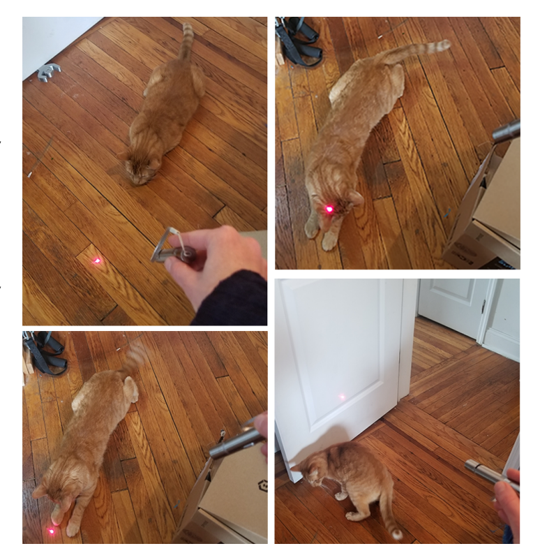
Figure 2: Chester gathers time series data of the red dot and various objects and surfaces throughout the room, sampling at a step size of 0.1 s, the integration time of his eye. He misses 12 points (e.g. top and bottom right panels), due to the incorporeal and light-speed properties of the dot.

Figure 4 shows Chester's observed time series: that of the red dot (top panel), laser pointer (second panel), four objects on which the red dot appeared, and one upon which it did not. The data begin at t \equiv 0 s, at which time the laser pointer time series (second panel) shows two seconds of observation. A two-second gap then separates the end of the laser pointer time series and the beginning of the red dot time series (t = 4.0 s), as Chester scanned for it. From then onward, the red dot time series is dense,