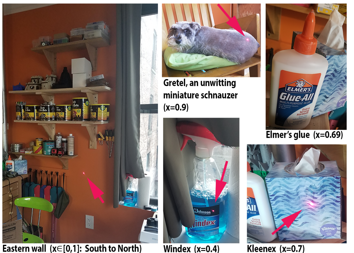
Figure 3: Objects throughout the room displayed in scalar direction x : the direction from South to North in the room. Red dot visits Northernmost Wall ( x \equiv 1.0 ), miniature schnauzer Gretel (x = 0.9), a box of Kleenex tissues (x = 0.7), and a spray bottle of Windex glass cleaner (x = 0.4). There exist multiple other objects in the room that the red dot does not visit, all of which are represented by the tccccc c ccc ime series of the (unobserved) Elmer's glue (x = 0.69).