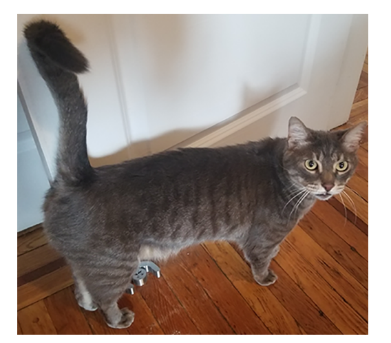
Figure 6: Mad Dog Lapynski, Chester's brother. Wandered in during the data collection.

While Chester recalls the dot/pointer correlation from past occasions, he allowed that this particular instance might be pegged on COVID-19 – because, well, at the moment most anything [44] might be pegged on COVID-19. That is, could the red dot be a hallucination?