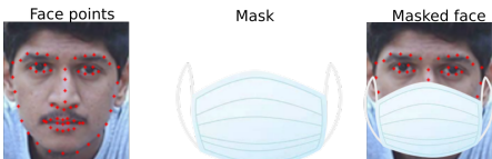
Figure 2. Example of the processing to add masks to the AffectNet: we find the facial keypoints on the images, and apply a geometrical transformation the mask to match the mouth key points.

The AffectNet [19] is our main evaluation platform, and it has more than 1 million images, crawled from the internet, with half of them manually annotated using mechanical Turk. Each image has a single label based on a continuous arousal and valence value, ranging from [-1 to 1] . The dataset authors separated it into specific training and validation subsets, which we use in our experiments. The main metric we use to measure performance is the concordance correlation coefficient (CCC) [15] between the models’ outputs and the true labels of the images. The FaceChannel showed to be competitive with other convolutional-based models when evaluated on the AffectNet [3], and we use this results as our performance baseline.