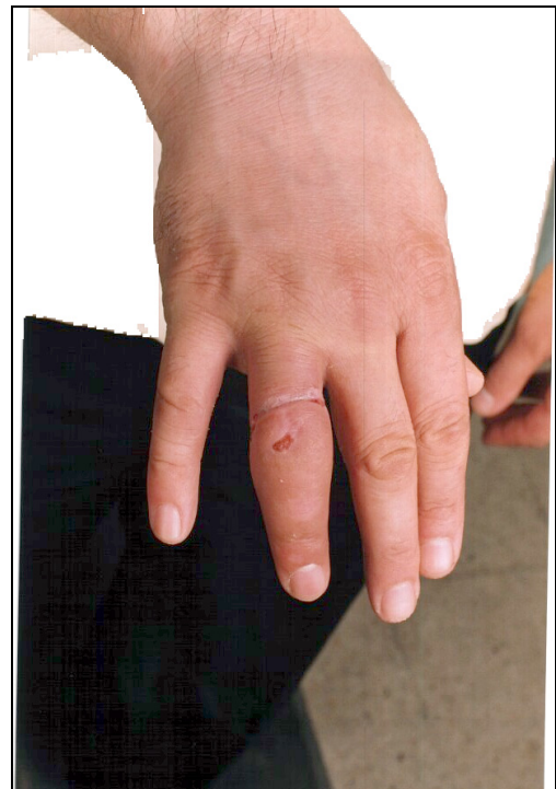
Figure 4. Image of the same case 8 weeks after leech treatment