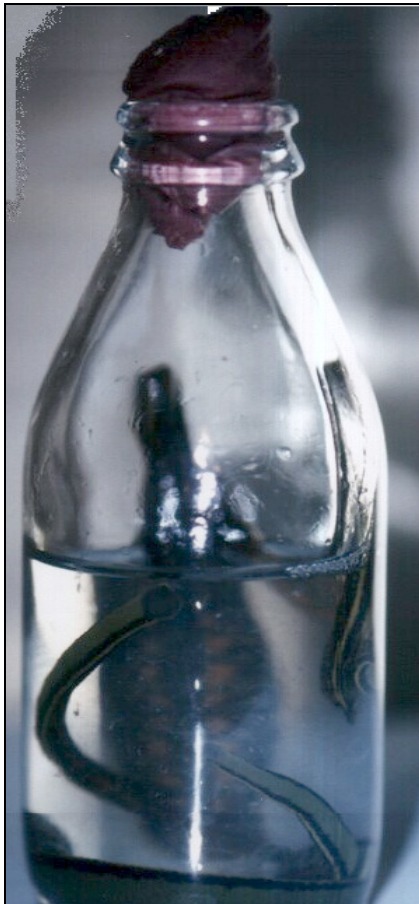
Figure 1. A replantation case where venous congestion has developed. Leeches in a bottle

The 20 patients applied with replantation and revascularisation in our clinic and in whom venous congestion then developed, presented directly at our clinic without having consulted any other healthcare institution. The time from injury to admittance for surgery of these 20 patients was mean 3.5 hours (range, 1-6 hours). Of the 11 patients with crush injuries, 6 were treated as outpatients for follow-up with a hand brace by external centres. These patients presented at our clinic at 1-3 days post-trauma. On presentation at our clinic, the finger ends of these patients were immediately pierced and in 4 patients, there was minimal serohaemorrhagic or serous fluid rather than blood and in 2 patients there was no bleeding or fluid discharge. The other 5 patients had presented at the Emergency Department and were immediately admitted to hospital for treatment.