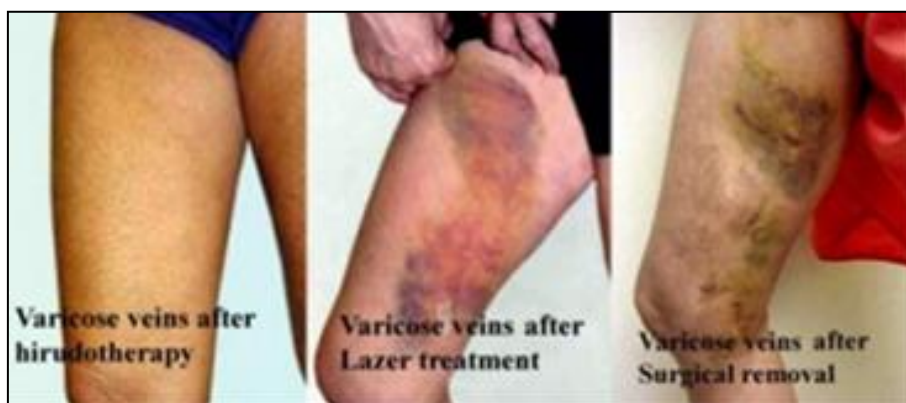
Fig 2: Shows the difference of results in the therapies in the course of varicose veins [13]

Zakaria Razi, Ibn Sina, Ismail Jurjani etc have mentioned fasad in dawali but M. Azam Khan and A. Arzani mentioned taleeq in varicose vein. The effect of leech therapy in varicose vein is due to the biochemical present in the saliva of the leech which contains anticoagulant, thrombolytic, anti-inflammatory, antibiotic, anesthetic and analgesic properties. Hirudin and calin are anticoagulants. Enzyme Destabilase has thrombolytic effect. Histamine like substances, acetylcholine and carboxipeptidase has vasodilator effect. Anticoagulant, thrombolytic and vasodilators present in saliva of leech produce prolonged bleeding and hypovolumic haemodilution of the blood which reduces pressure at the vessels and excretion of metabolites at the site of microcirculatory units [24].