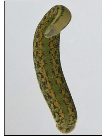
Fig 1: The Medicinal Leech

Leeches are blood sucking annelid worms. Leech has segmented bodies. Their mouth is tri radiate, they have 3 jaws and each jaw has 80-100 teeth, and gives characteristic Y shape incision at the site of bite. They have 2 suckers, anterior sucker and posterior sucker. The anterior sucker is the proboscis which is meant for feeding and attachment and the posterior sucker is meant for attachment and locomotion. The characteristic features of medicinal leeches are that they Small head, small bodies. They have Emerald green color or greenish brown color with two yellow stripes running along the body (Figure 1). Usually found in clean water lakes and ponds, covered with weeds where frogs exist [10].