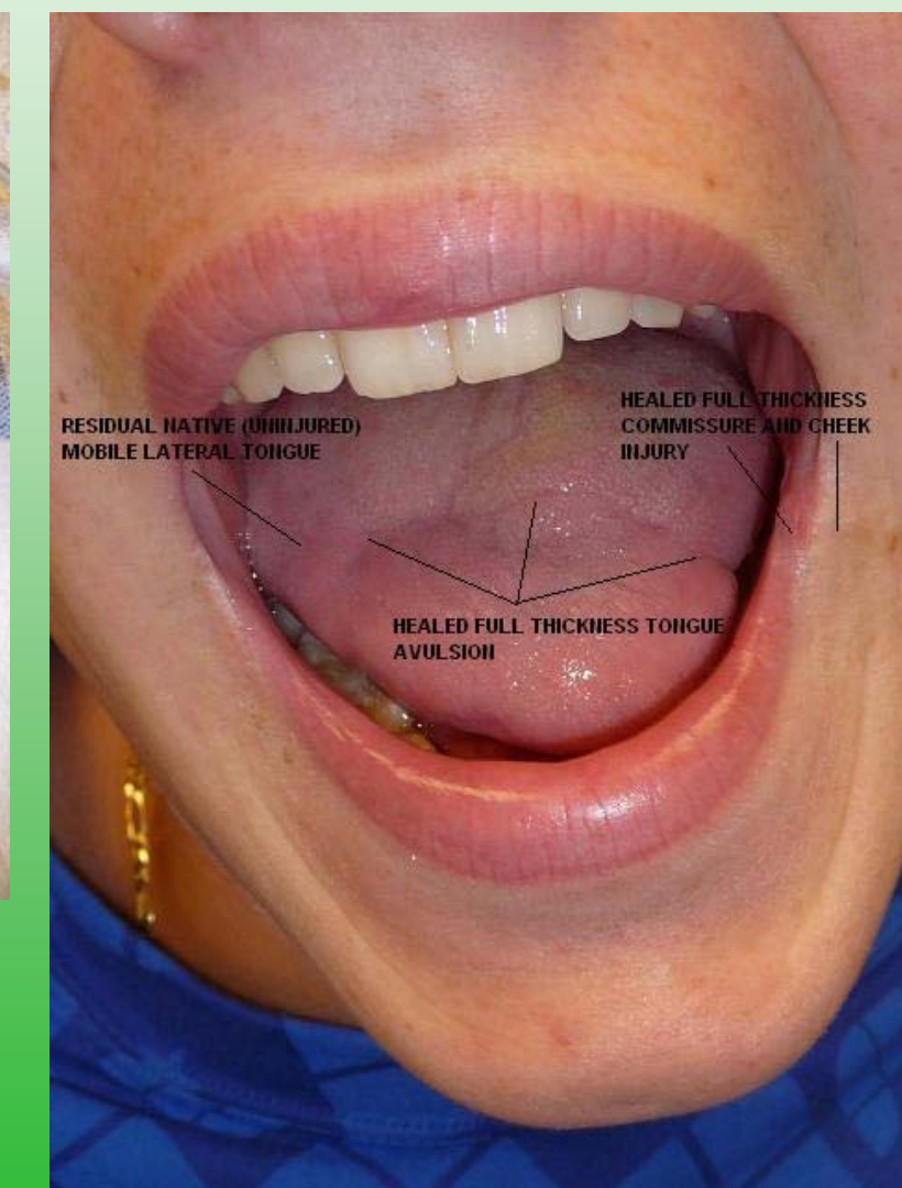
Figure 5: Final result