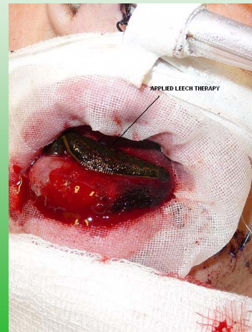
Figure 3: Application of Leeches