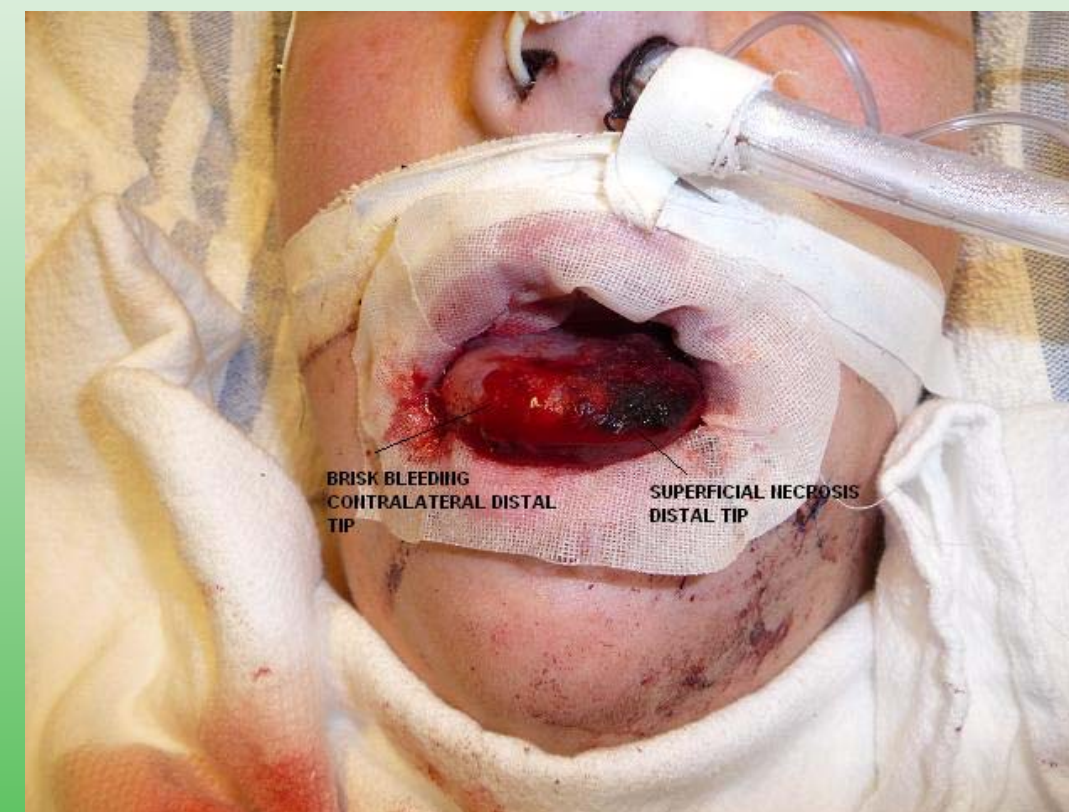
Figure 4: Demarcation of necrosis and distal brisk bleeding