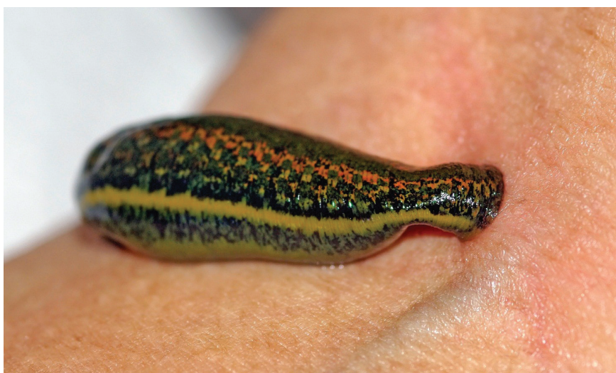
Figure 2: Image of an adult leech ( Hirudo medicinalis ) feeding via the anterior sucker. Leeches consume between 5-15mls of blood during a feeding episode. The consumed blood may remain within the digestive tract for up to one year protected from microbial decay.

been discovered to date, yet it is one – H. Medicinalis – whose use predominates in medicine. Biopharm, a company based in Wales, is the main supplier for the National Health Service (NHS). They breed their leeches in 'warm rooms' and despite being hermaphrodites, these worms copulate underwater before emerging on a daily basis to lay a cocoon up to five times a week for up to six weeks. The cocoons usually hatch after a period of three weeks producing live young. H. medicinalis measure on average 2.5-5cm in length and weigh 1-1.5g prior to feeding [3]. H. medicinalis has a